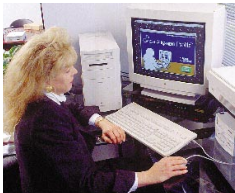
CAP™, AN INNOVATIVE AND INTERACTIVE CAREER PLANNING PROGRAM DEVELOPED BY CMI, HELPS THE USER DETERMINE THE CAREER PATH TO WHICH HE OR SHE IS BEST SUITED (BOTTOM LEFT).

Another of CMI's developments has blossomed into an attraction on the World Wide Web. Kingdomality™, a personality preference profile designed by CMI, attracted 20,000 "hits" in its first week on the Web, and now routinely captures the attention of 800 to 1,000 Internet users each day. Kingdomality™